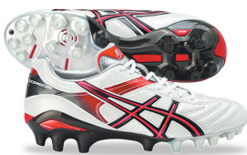
LETHAL TIGREOR 5IT $219