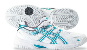
ASICS WOMENS GEL-PIVOT 8 $99