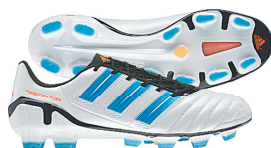
MENS ADIPOWER PREDATOR TRX FG $299 BONUS ADIDAS SPORTS BAG WITH THESE BOOTS