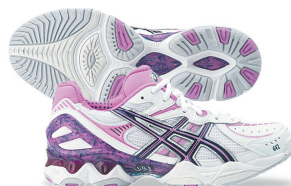
ASICS WOMENS GEL-NETBURNER SUPER 2 $199