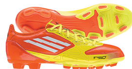
MENS F5 TRX FG $69.99