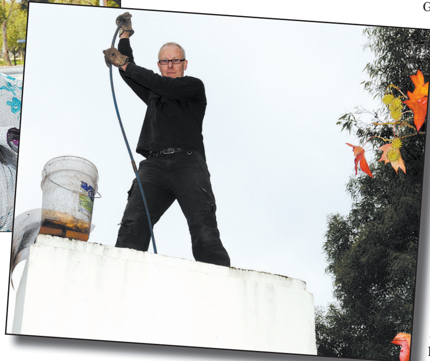
ew is a Hills chimney sweep. Their lives are vastly different, linked by a love of music.

And despite his millionaire rock star lifestyle the INXS star still cleans his own windows on his South Coast house in NSW ... albeit with top notch equipment from his brother.