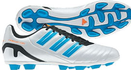
PREDITO TRX HG $69.99