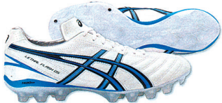
LETHAL FLASH D5 IT $159