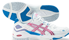
ASICS WOMENS GEL-ACADEMY 4 $139