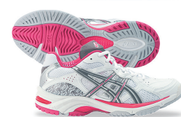
ASICS GIRLS GEL NETBURNER 14GS $99