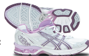
ASICS WOMENS GEL-NETBURNER PRO 8 $189