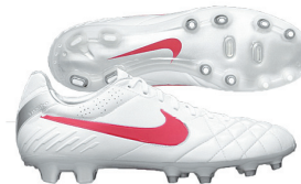
TIEMPO LEGEND IV FG $219